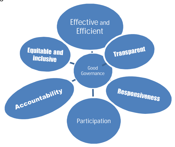
Figure: 1. 1: Issues in Good Governance

The success of decentralized planning rests its objectives such as efficiency, transparency, accountability, responsibility and participation, social equity and gender equality. The aim of Egovernance is to enhance these objectives by not only helping service delivery of the local government but it has an influence over all the spheres of activities of the local governments. Hence the effect of egovernance could be seen on the basis of supporting of e-governance for attaining the above said objective on a time bound manner.