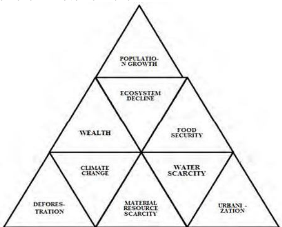
Figure 1: Interconnected system of social and environmental forces