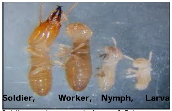
Soldier, worker, nymph, larva of Odontotermes